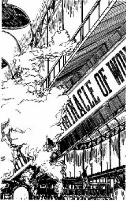
Dame Railway and Her Choo-Choo Court, Cincinnati Ironmongery Fair, 1852

On the morning of 2 July 1881 President James Garfield, accompanied by his Secretary of State, James G. Blaine, was passing through the central railway station in Washington, DC, to spend the Fourth of July holiday on the New Jersey shore with his family. His wife had only recently recovered from a nearly fatal bout of malaria and he was naturally anxious to be with her. In those days there was no Secret Service protection for the President. On occasions such as this the President was quite literally a public figure. Anyone could approach him, and one man did – a quietly deranged lawyer named Charles Guiteau, who walked up to the President and calmly shot him twice with a .44-calibre revolver, then stepped aside and awaited arrest. Despite a notable absence of qualifications Guiteau had long pestered the President to make him chief consul in Paris.