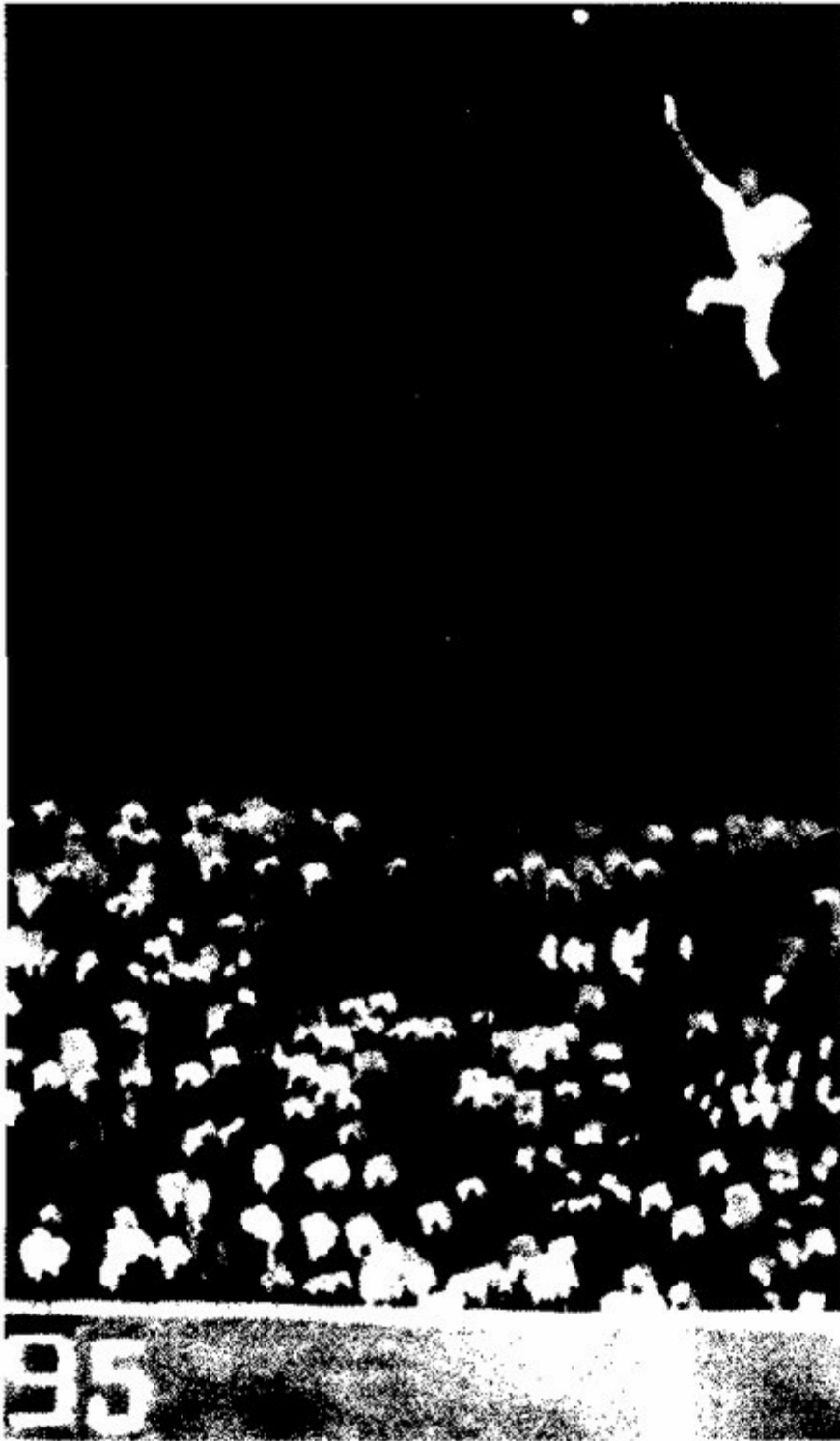
Hoplock's amazing catch in the 1946 World Series