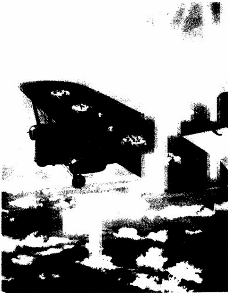
Wing dining, somewhere over France, 1929