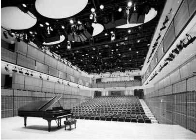
Zankel Hall, one of our many projects in the restoration of Carnegie Hall. It had been a theater until the 1960s, and a cinema until 1997.

their big seven-year vision book into bite-size, accomplishable portions of work. During each twenty-six-week burst, construction would go on around the clock, with materials being delivered at all hours.