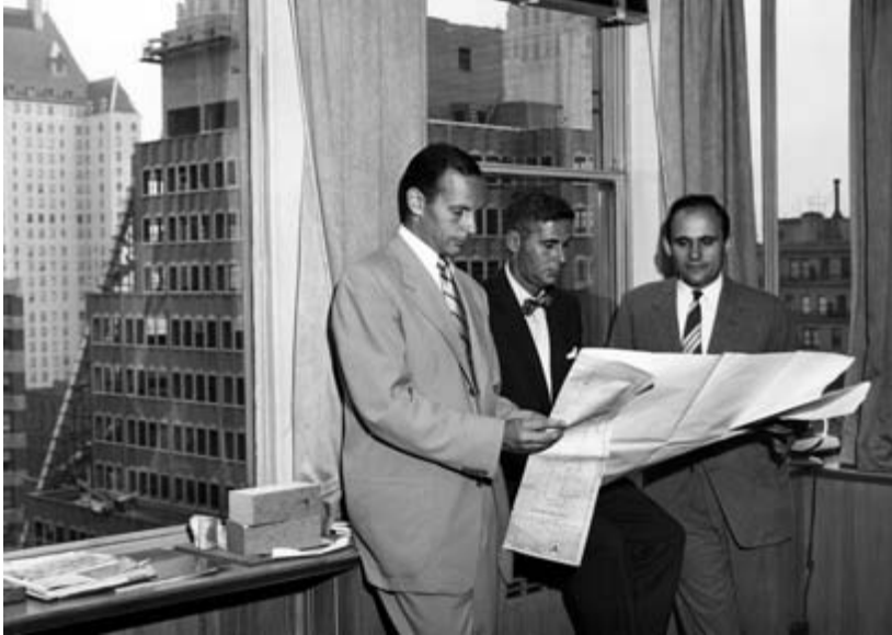
With the architects, looking over the plans for constructing our second headquarters, 460 Park Avenue.

in attaching aluminum facades had advanced to the point where we figured that we would be able to hang the aluminum façade in a matter of hours rather than days. This, we also thought, was enough of an astonishing feat that it could get us some publicity. Life magazine agreed, and in early October 1960 they sent a photographer to document our installing all of the facades facing both Park Avenue and 57th Street in a single day. We even did better, completing the task in a mere thirteen hours—a hectic day but a great one. After it, we were expecting what Life had more or less promised, a centerfold story in the nation's leading pictorial magazine—when Soviet premier Nikita Khrushchev decided to bang his shoe on a desk at the United Nations to protest something said by another country's delegate, and Life decided that the shoe-banging was more newsworthy than our construction exploit, and relegated us to only an inside-the-magazine story. That aside, we did get quite a bit of positive press for the accomplishment. It even