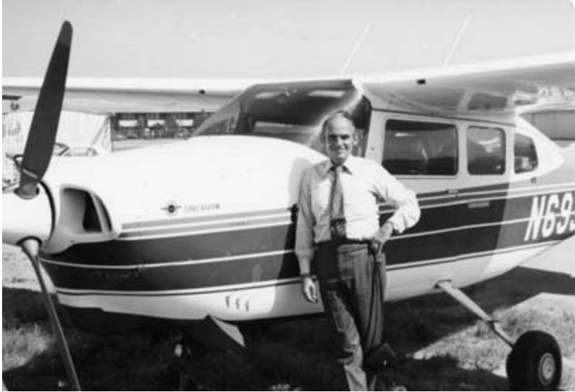
Flying my own plane was my avocation and my joy.