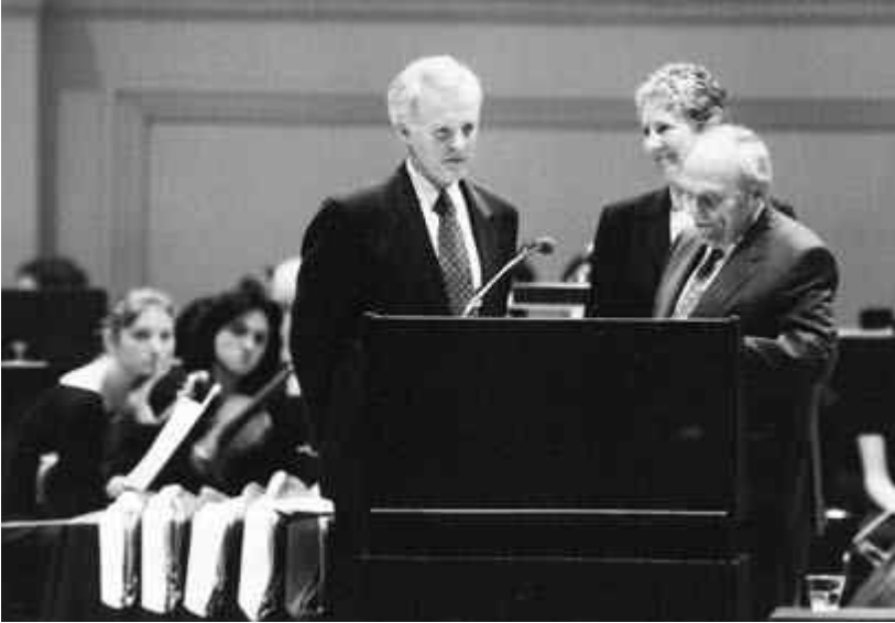
Inducting former Senator Bob Kerrey as president of The New School, May 2002.