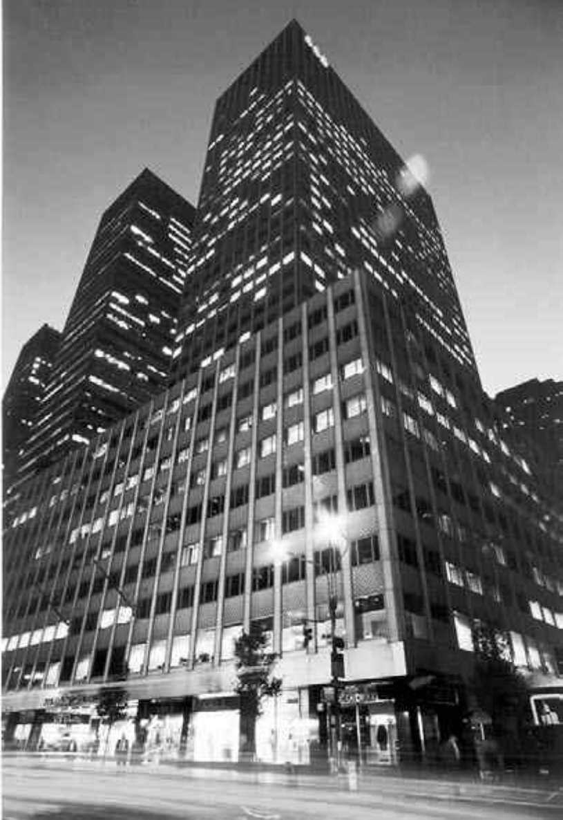
The Tishman Building, 666 Fifth Avenue, with its distinctive aluminum façade.