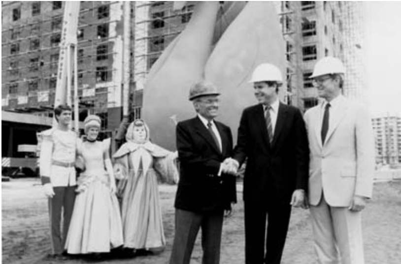
Ground-breaking for our first hotel at Disney World. Michael Eisner and Frank Wells had only recently joined the Walt Disney Company.

With a minimum of fuss, the Disney executives signed this contract, and we planned a groundbreaking ceremony. Disney took over the preparations for that ceremony and made it into a grand one, replete with Mickey Mouse leading the festivities, marching bands, and their top executives turning over shovels full of dirt for the benefit of the television cameras. Those executives included two brand new ones, Michael Eisner and Frank Wells—who, that day, were all smiles as they took part in the festivities and examined the detailed, full-scale model of the entire Disney World area, including EPCOT and our proposed hotel.