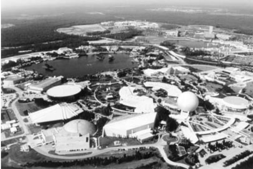
Our largest project in terms of land area, number of buildings, and complexity: EPCOT at Disney World.

A third pavilion, whose theme was the oceans, was to contain the world's largest aquarium; its visitors could walk right alongside the aquarium and sometimes through the parts.