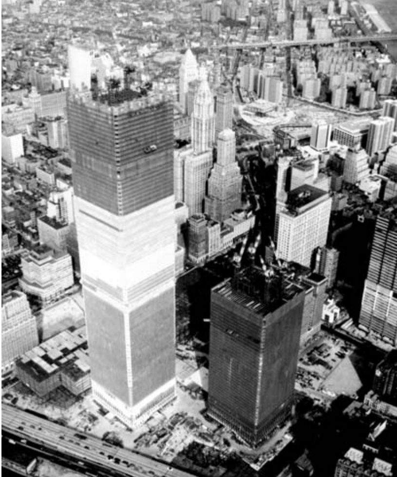
Tishman Construction served as Manager for the Port Authority of New York and New Jersey for the original World Trade Center towers.

do all the interior layouts, detailed drawings, and construction documents. Yamasaki was the hot architect of the moment, having recently shot to prominence with designs for a synagogue in suburban Chicago, the 1962 Seattle World's Fair, a building at Harvard, and a skyscraper in Detroit.