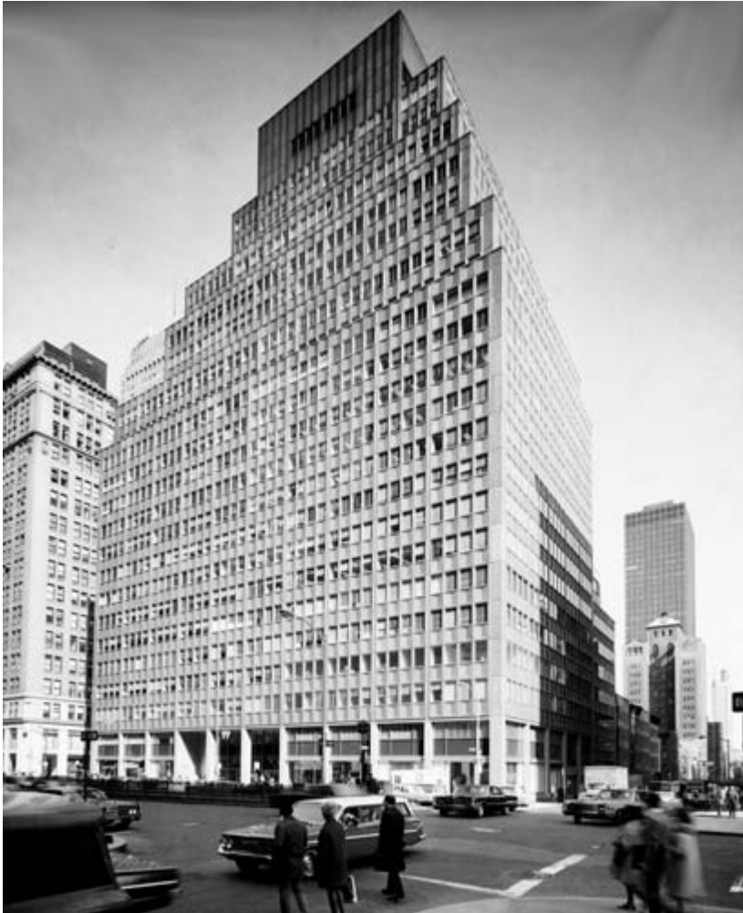
99 Park Avenue. Its all-aluminum façade was erected in just six days.

that were almost always about things that were supposedly being done wrong, things they thought that I was responsible for. Their black book was a report card on me to be shown to Uncle David, a way of documenting where I was falling short, so that Bill could be advanced over me.