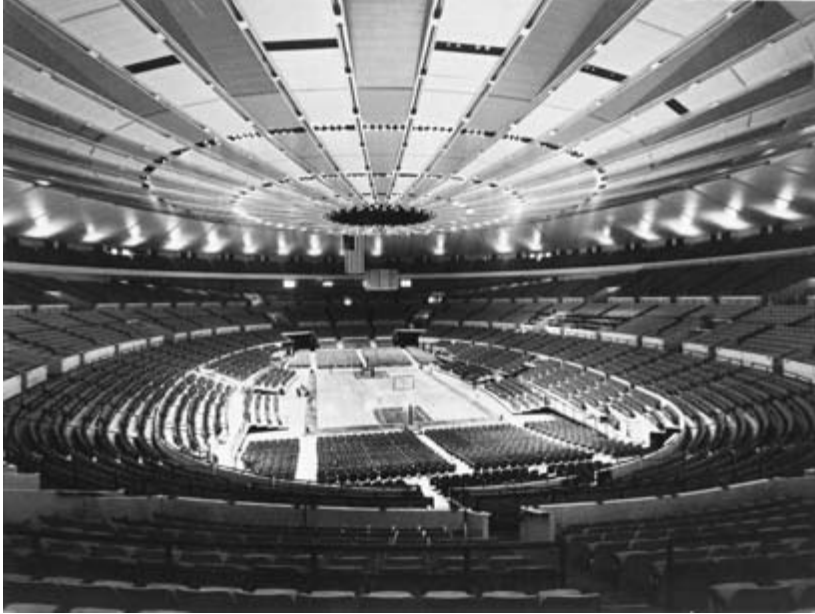
Our construction division's first project for an outside firm, Madison Square Garden.