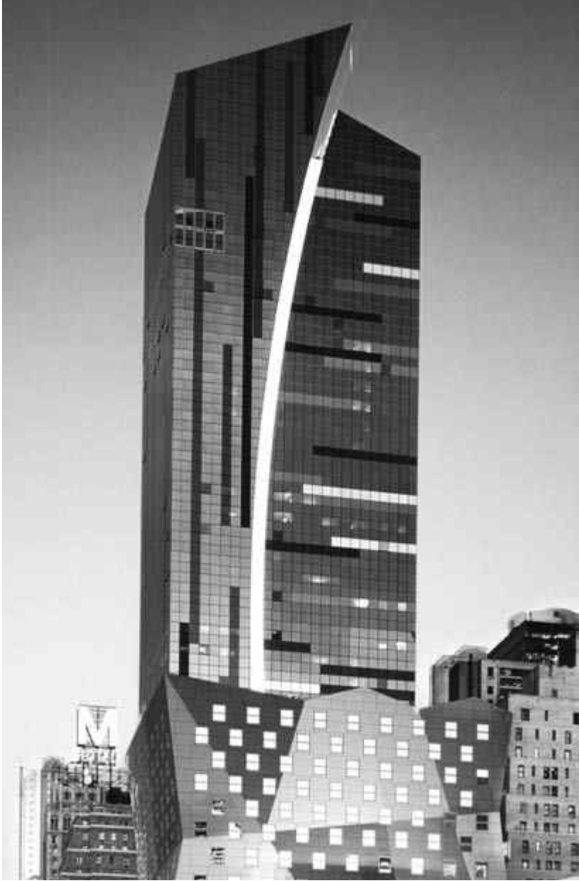
The Westin Hotel.