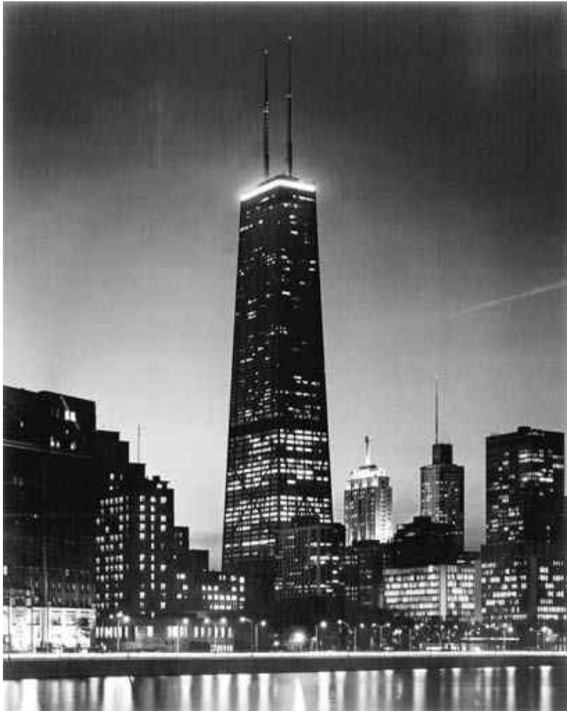
John Hancock Center, Chicago.