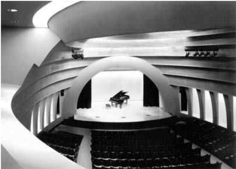
The auditorium at The New School, originally designed by Joseph Urban and Rudy Baumfeld, which we restored.

“Look up,” I replied. Suspended over my desk was a huge lighting fixture featuring the same bright vermillion that was to be used on the feature columns. The dramatic color did not distract from anything, I argued; in the hall, the vermillion columns merely served as a striking feature, as designed by Rudy Baumfeld, a Viennese architect and