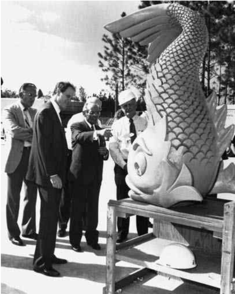
After the grand compromise: examining sculptures for the Dolphin and Swan Hotels at EPCOT.