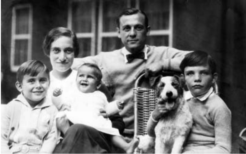
My mother, father, siblings, and me in 1930. I'm on the left.

took over the direction of the company. Concurrently, and unheard of for real estate companies at the time, they decided to take the company public in 1928, under the name of Tishman Realty & Construction Co., Inc. Part of the financing for the stock float was arranged through my mother's relatives and their friends in the Chicago banking business. It was a moment when stocks of all sorts were rising fast, and going public seemed a good way to make money. A minority of the shares were held aside and sold to the public, but the overwhelming majority of the Tishman Realty shares were divided equally among the five brothers, each receiving 20 percent. Tishman Realty became a public firm controlled by the family stock ownership.