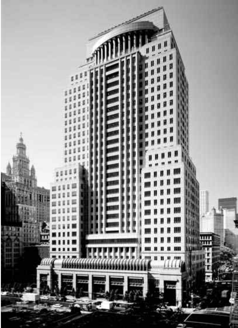
The Jacob Javits Federal Building in Foley Square, Manhattan, one of our many public-sector projects after we convinced the Public Buildings Service of the CM approach.