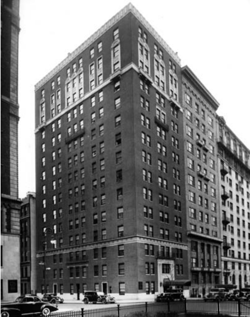
One of the early buildings constructed by Tishman Real Estate, 935 Park Avenue, in 1923.