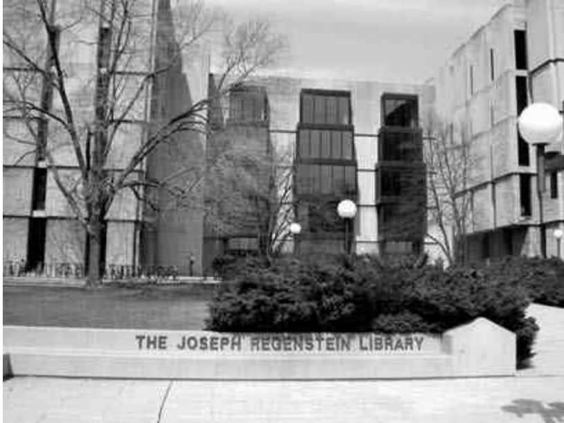
The Regenstein Library at the University of Chicago, our first Construction Management project involving federal government funds.

be constructed for less than $12 million. These design changes were basic, structural ones, and really should have been the basis for the original plans. The various parties agreed to the alteration, the building was constructed, and it met everyone's expectations.