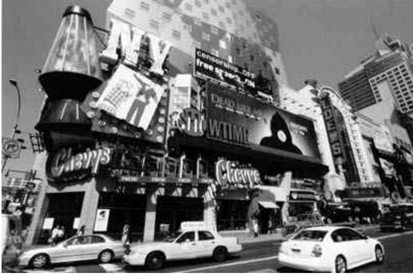
E-Walk and its associated hotel have revitalized the Times Square-42nd Street area.

We told the architects that we wanted something jazzy and reflective of 42nd Street’s history as the city’s entertainment center. We were going to have to spend a lot of money to win this prize, pay for a multitude of designs and models, and also work to satisfy the regulators—the site was under the jurisdiction of New York State as well as New York City. We were going to have financial partners, as well as involving the Westin Hotel chain as eventual operators—they, too, wanted a say in the design. When the early Architectonica sketches came in, my partners objected to them as too over-the-top, too glitzy, not enough like a “real” hotel. I loved the designs, and eventually prevailed on my partners to accept them as the best way to win the competition.