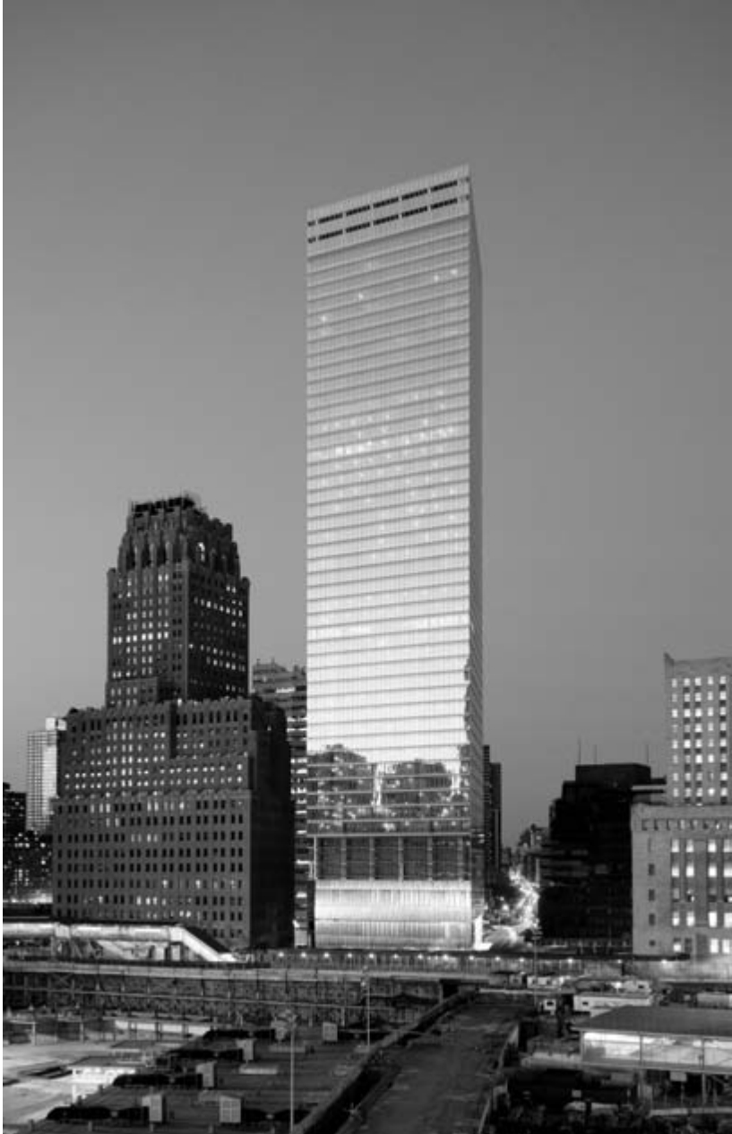
The new Number 7 World Trade Center.