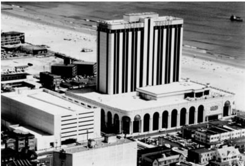
Our first project for Steve Wynn, the Golden Nugget in Atlantic City.