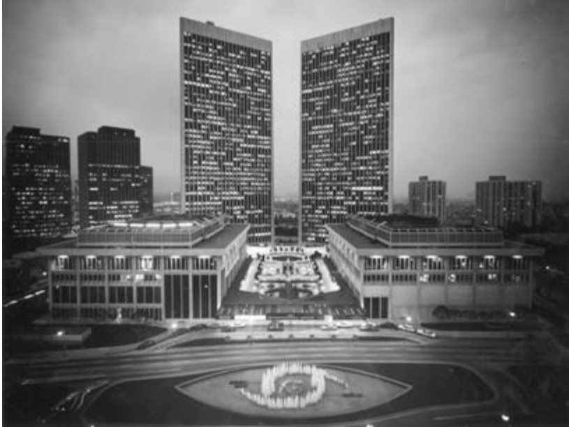
Century City in Los Angeles, built for Alcoa, and designed by Yamasaki, its façade an echo of his World Trade Center.

years construction materials and techniques had improved, but the code had not been changed.