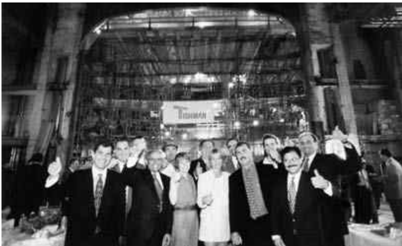
Team spirit at Tishman Construction as we were finishing restoration of the New Amsterdam theater on 42nd Street.

My informal style traces back to my childhood at the Walden School, where we were taught to address teachers by their first names—a great way to break down artificial barriers between teacher and students. I've always encouraged everyone in the company to call me