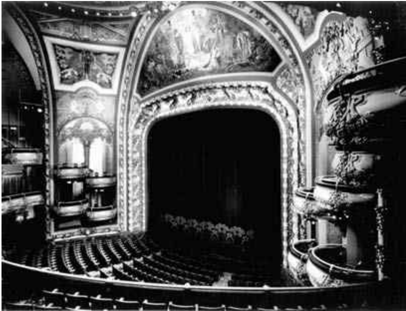
The New Amsterdam Theater, a beautiful restoration for the Disney Company, in the Times Square area.

I contributed a bit to bringing Disney to 42nd Street. One day, several Disney executives and I visited the then-decrepit New Amsterdam Theatre on 42nd Street. Mushrooms were growing in the interior. There