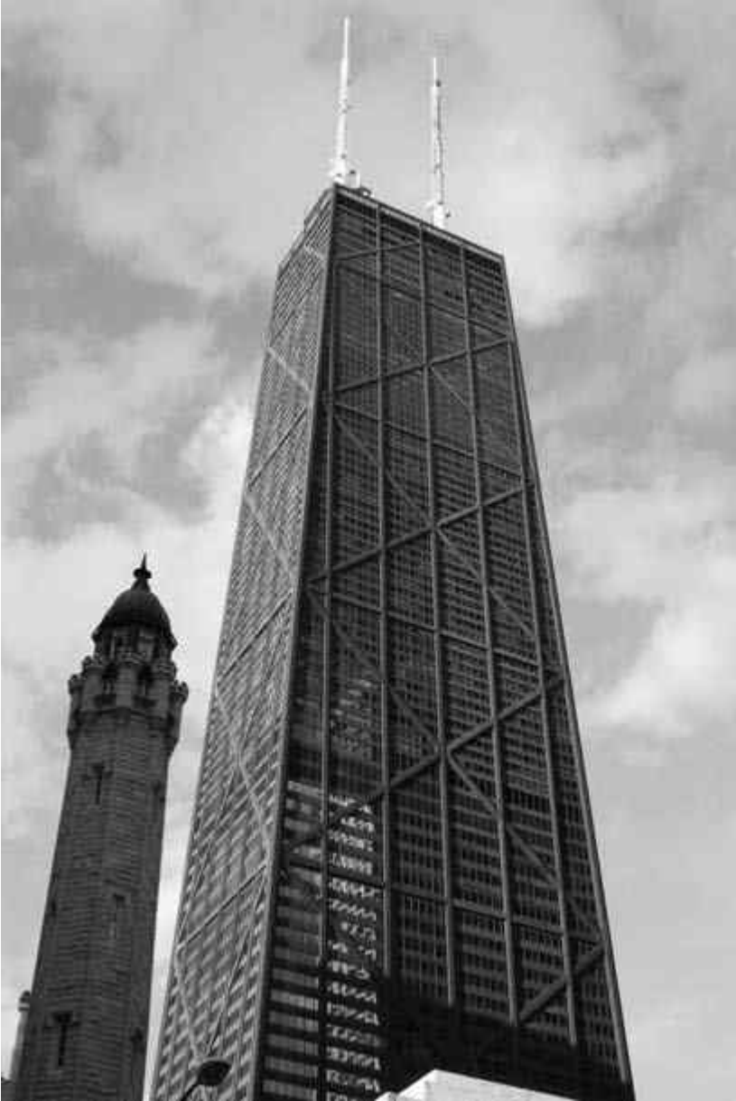
Chicago's Hancock Tower—the world's first hundred-story building. We served as its Construction Managers.