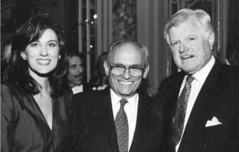
Ted Kennedy, seen here with his wife, Victoria, in 2000, was honored at The New School.

long friendship between us—I told him that I was dissatisfied with the size of board as well as its makeup.