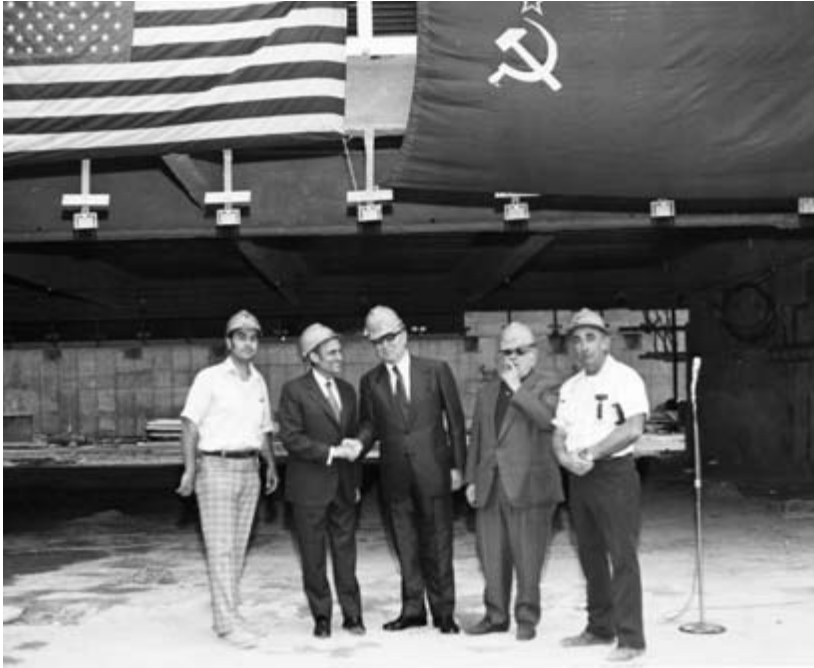
A topping-off ceremony for the Russian consulate in the Riverdale section of the Bronx.

Seeing no alternative, we were resigned to write it off; however, one of our subcontractors, who also hadn't received his payment, was not. He had gone to considerable expense to manufacture an unusually wide door for the garage. After his many attempts to obtain payment for the work had failed, this subcontractor decided to take another route. He and his workmen showed up at this ultra-secret Soviet facility in the middle of the night; they brought their truck right up to the building, removed the special door they had made, and carted it back to their factory. How had they gotten past the security detail? I don't know, but my guess is that the night watchman at the Soviet compound must have been an FBI operative who saw fit to cooperate with the subcontractor's nighttime repo raid.