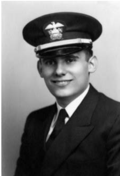
Ensign in the U.S. Navy, 1946.