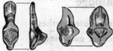
TWO BIRD-WOMAN FIGURES mammoth ivory, Mezin